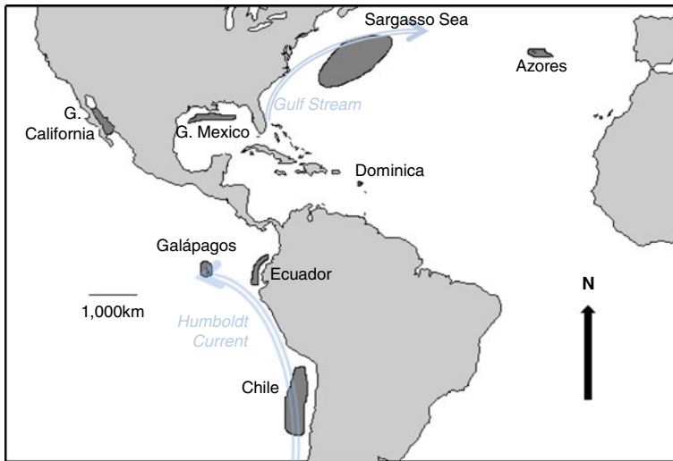
Fig. 1 Map showing study locations, Gulf Stream, and Humboldt Current.